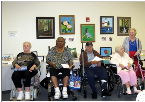
Residents from Baptist Village, along with artwork they submitted to the art show.

The Southern Georgia Area Agency on Aging and Satilla Community Services joined forces on May 19 to hold the 1 st Annual Southern Georgia ADRC "Art and Soul" Open House and Art Show. The event, which was held at the Southern Georgia Regional Commission office in Waycross, provided professionals and individuals dealing with issues related to aging or disability the opportunity to learn more about the ADRC program.